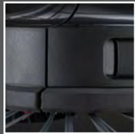
Touch Shield A buffer that, when touched, causes the immediate stop of the robot