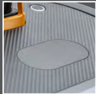
Top Camera Used to navigate the environment alongside onboard maps

The innovative integration of state-of-the-art sensor technology allowing autonomous navigation and obstacle avoidance, even within complex areas.