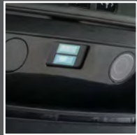
Main Camera Used to identify obstacles and people, and navigate around them